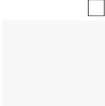
White RAL 9016