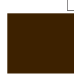
Sepia Brown RAL 8014