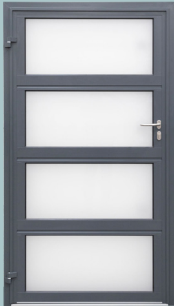
Matching side doors available.

Selecting the section colour and glazing type creates your door.