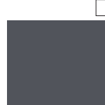
Slate Grey RAL 7015