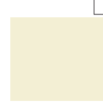
Cream RAL 9001