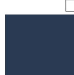
Steel Blue RAL 5011