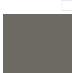
Umbra Grey RAL 7022