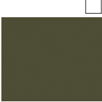
Quartz Grey RAL 7039