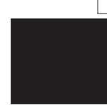
Jet Black RAL 9005