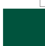
Moss Green RAL 6005