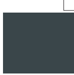
Anthracite Grey RAL 7016