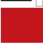
Flame Red RAL 3000