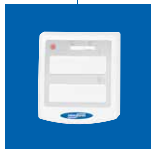
Signal 112 wall switch Start key, holiday switch, continuous light (On/ Off), 24 V connection to the operator in UV-resistant material