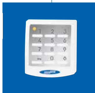
Signal 218 remote coded key pad 10 codes, 433 MHz, KeeLoq rolling code with stainless steel cover, backlit in UV-resistant material