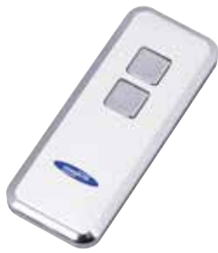
Mini-Novotron 522 Design hand transmitter 2-channel, 433 MHz, KeeLoq rolling code