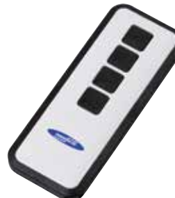
Mini-Novotron 524 hand transmitter 4-channel, 433 MHz, KeeLoq rolling code