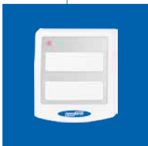
Signal 111 remote wall switch 2-channel, 433 MHz, KeeLoq rolling code for controlling 2 operators or 1 operator and 1 outside lighting in UV-resistant material