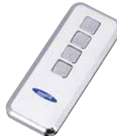
Mini-Novotron 524 Design hand transmitter 4-channel, 433 MHz, KeeLoq rolling code