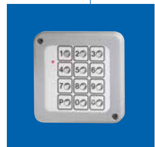
Coded key pad signal 213 3 signals, metal key pad, 230 V connection