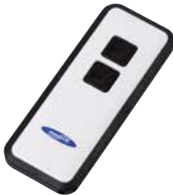
Mini-Novotron 522 hand transmitter 2-channel, 433 MHz, KeeLoq rolling code